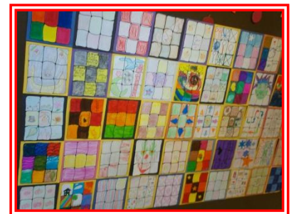
-Patch Quilt Made By The AEP Students-

PATH – East Stroudsburg: The East Stroudsburg center was bursting at the “seams” with holiday cheer. The students of the Alternative Education Program (AEP) completed a patch work quilt for the Thanksgiving holiday. The quilt patches were generated by the students and on each of the patches listed something that they were grateful for in their lives. The students took great pride in this project as a way of being able to express their thanks and to also come together with the other students and generate a beautiful quilt that is on display at the East Stroudsburg Center. The students also prepared a Thanksgiving meal with items they brought in and prepared. The meal allowed the students to strengthen their cooking skills and communication skills with each other.