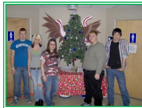
-Youth Decorating The Center -