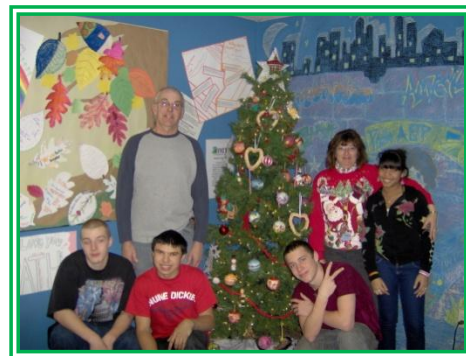
-The Honesdale Christmas Tree-

The Christmas holiday kicked off in Honesdale with having the Scranton Center make the journey to the center. This would mark the third time the two centers have broken bread together and shared a day of interactive therapy. The AEP students and the After School clients prepared the center for Christmas by decorating with snowflakes and candy canes as well as a beautiful Christmas tree.