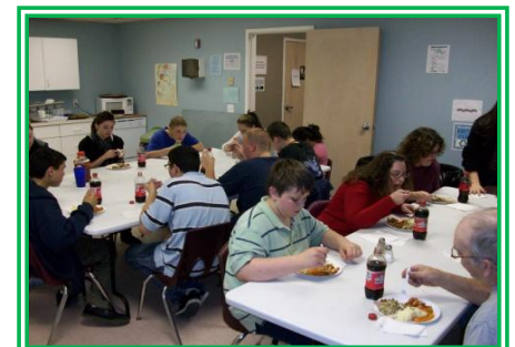
-Multiple Centers Join For Dinner-

The group allowed the clients and staff to share their blessings with each other and generate a positive atmosphere. Both centers enjoyed a turkey dinner with all the trimmings and allowed more