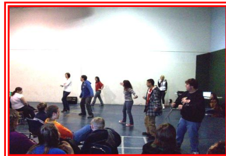
-Clients Participating in Labor Of - Love Skit

The Scranton center also hosted an event presented by Labor of Love . Their presentation was held in the gym at the Scranton Center as other PATH centers attended the event. The L.O.L. gave the youth and staff in attendance a positive uplifting message as well as had the audience members participate in skits to drive home the message. The Scranton Center would like to thank Labor Of Love for their beautiful message and uplifting performance that truly enhanced the Christmas holiday for all those in attendance.