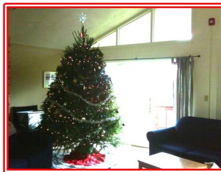
-Middleburg Christmas Tree-