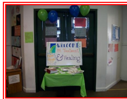
-Lehighton Open House 2010-