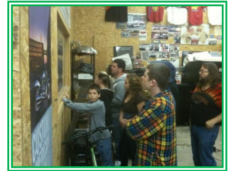
-Students At The Harley Shop-

As mentioned in the October issue of The Path, the Bloomsburg Alternative Education Program (AEP) students finished their project on constructing benches for the new outdoors sports complex at the Bloomsburg town park. The students had a fabulous time creating the benches and giving back to the community. The benches will be placed in the park during the spring season. The students also made a field trip to the Harley Davidson shop in Bloomsburg. The students were able to learn about job opportunities in the field of mechanics and they were treated to a tour of the shop.