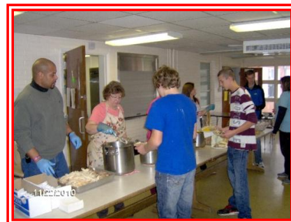
- Thanksgiving Dinner Preparation-