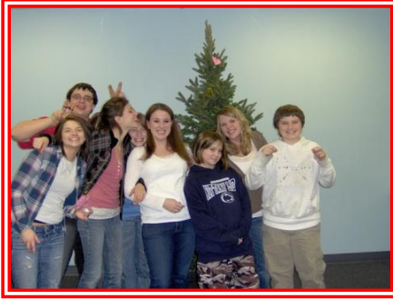
-Clients Decorating The Christmas- Tree-