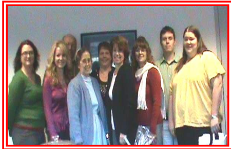
-PATH Corporate Staff

The Corporate Office had an opportunity to celebrate the Christmas holiday by having a pot luck lunch. The Corporate staff enjoyed a lunch hour eating and conversing among each other before the holiday. The Corporate Office would like to wish everyone a successful and blessed New Year!