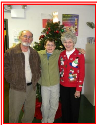
-Client &amp; His Family-