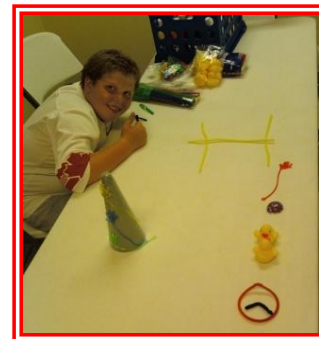
-3D Model Of The- Path Of Life

The Intensive Adolescent program is showing fruits of their labor as they prepare for a successful discharge in October. The IA program has been focusing on the PATH of Life Model as well as the IA clients have been developing 3D models of their interpretation of the Path of Life Model. Both staff and clients thoroughly enjoyed the time spent creating the models and the bond that was generated between staff and clients while completing the treatment component.