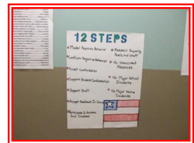
-12 Steps To Becoming A Leader-