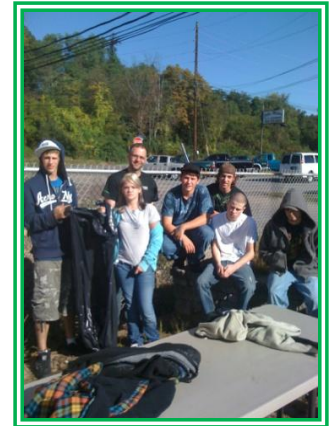
-AEP Clean Up Crew-