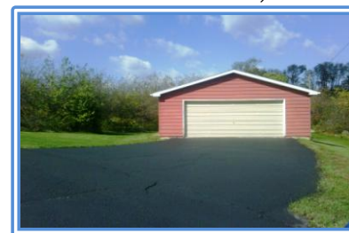
-Improvements At The Halfway House-

The residents of the Halfway House are already achieving great accomplishments in their school work as well as in their treatment. The residents and staff are dedicated to achieving success and refuse